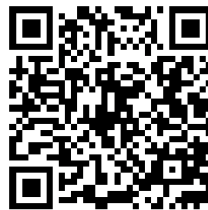
✓ Multi choice poll

Single choice: There are multiple options to choose from, but only one answer can be selected.